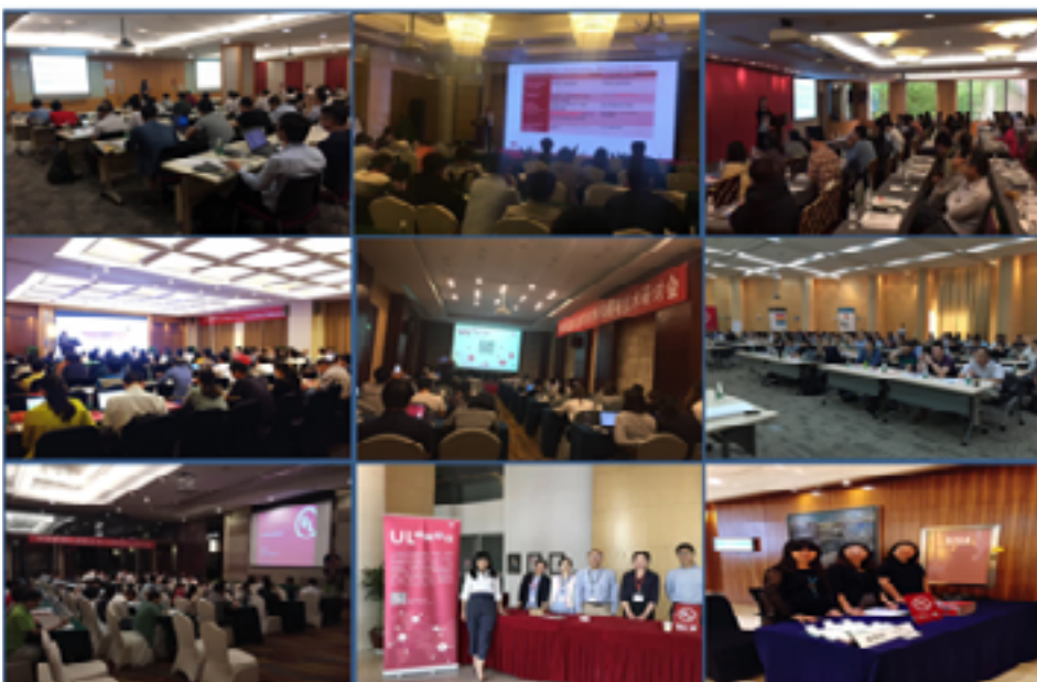
2017 UL Lighting Tour Seminars were successfully held in Guangzhou, Hangzhou, Shenzhen, Shanghai, Suzhou, Xiamen and Ningbo

In the future, promoted by "The Belt and Road" policy, LED lighting will bring to the domestic lighting enterprises more opportunities for development, and how to break the trade barriers between countries will be a compulsory