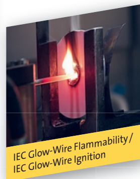
IEC Glow-Wire Flammability/ IEC Glow-Wire Ignition