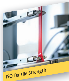
ISO Tensile Strength

The White Card, an extension at the bottom of a Yellow Card, allows you to promote your product's performance credentials to the global markets. It relates to international standards, while the information on the Yellow Card is typically relevant to North America.