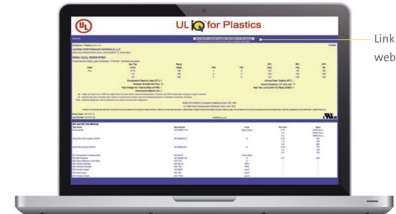
Link to your website

UL Yellow Cards are listed in various UL databases, which are used by end product manufacturers to find providers of verified materials and components. If they search for specific material properties and don't find your products, they'll choose another provider.