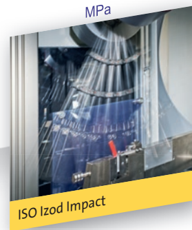
ISO Izod Impact