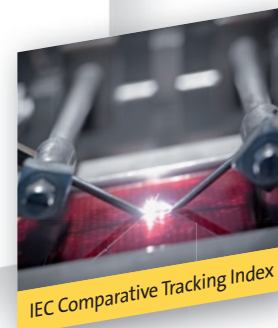
IEC Comparative Tracking Index